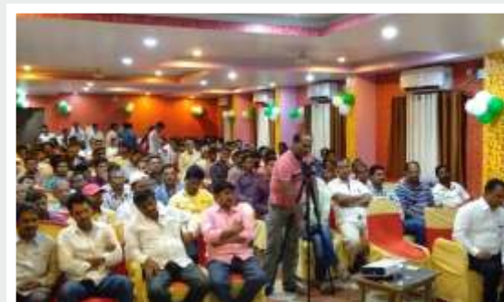
Contractor/carpenter Contact Program - Begusarai Bihar