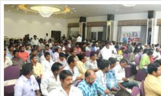
Contractor/carpenter Contact Program - Anantpur - Hyderabad