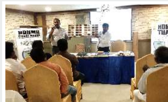
Contractor/carpenter Contact Program - Coimbatore