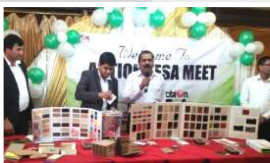
Contractor/carpenter Contact Program - Delhi

With a mission to overcome the traditional myth pertaining to toughness & longevity of MDF/ Particle Board/ HDHMR, Action TESA takes pride in being able to succeed in it's endeavour. This initiative of ours has been widely appreciated by Contractors & Carpenters who are associated with Interior Infrastructure Industry at the grass root level. Through CCP's (Contractor/carpenter Contact Programmes) we could convince them that our ready to use product are not only best in quality as compared to traditional products but are also cost effective in terms of manpower, material & time. Usage of our products enhances recognition of carpenter/ contractor amongst his clients for providing the best finished product using best quality innovative raw material in shortest time. Further we could convince them the essence of Engineered Panels in meeting the challenges posed by modern interior infrastructure industry concerning Environment, Aesthetics, Time & Cost. Due to highly interactive & informative sessions CCP's are highly applauded and accepted across PAN India.