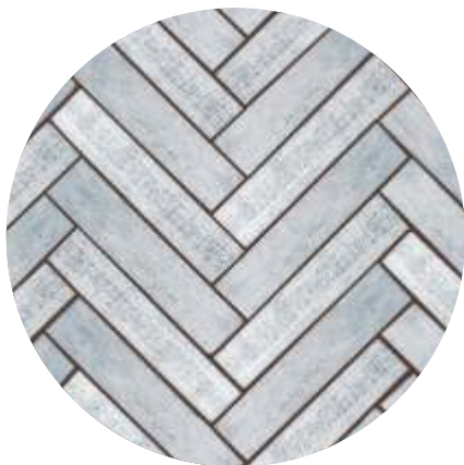
SINGLE PATTERN ( 3580, 3573 ) HERRINGBONE