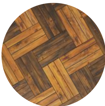
DIAGONAL HERRINGBONE -WEAVE ( 3090, 3092 )