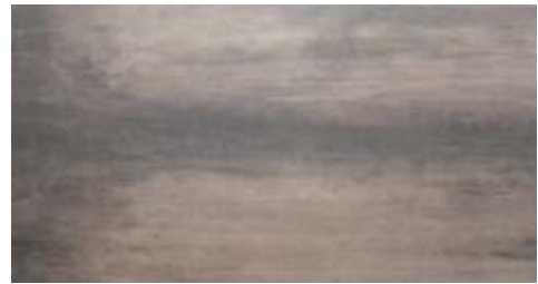
Silver Wood (MT)