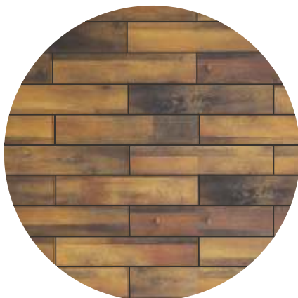
BRICK - V ( 3579 )