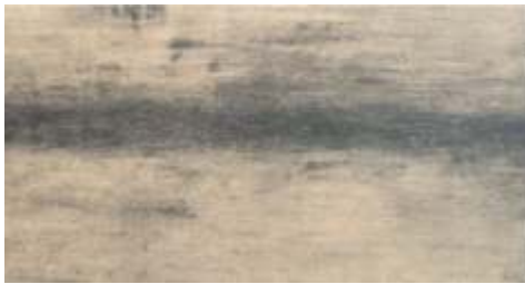
Bleached Walnut (MT)

French Bleed is a beautiful staining technique intended to give the look of aged wood with dark, contrasting edges. This style works well in many décors but is often blended harmoniously with rustic & country cottage styles!