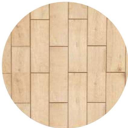
BRICK - H ( 3578 )