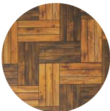
DIAGONAL HERRINGBONE -3P ( 3090, 3092 )