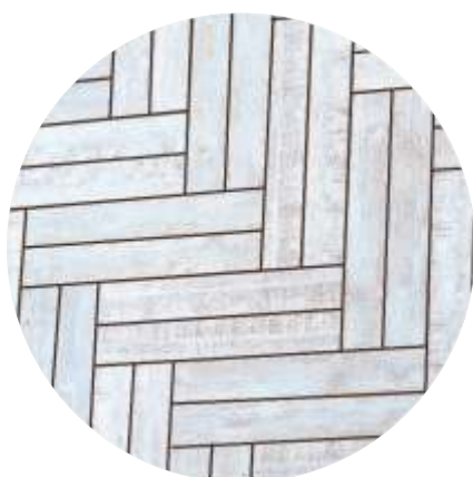
DIAGONAL HERRINGBONE - 2P ( 3580, 3573 )