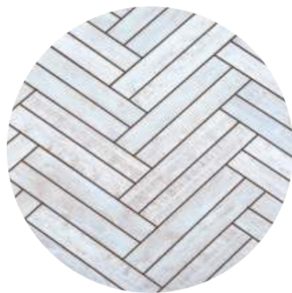
DOUBLE HERRINGBONE ( 3580, 3573 )