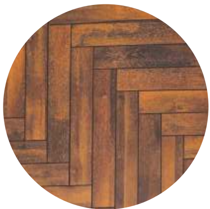
DIAGONAL HERRINGBONE (1P) ( 3579 )