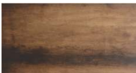
Harvest Chest (MT)