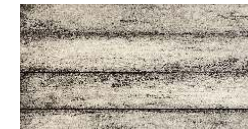
Bleached Walnut (DD) Code: 3581

French Bleed is a beautiful staining technique intended to give the look of aged wood with dark, contrasting edges. This style works well in many décors but is often blended harmoniously with rustic & country cottage styles!