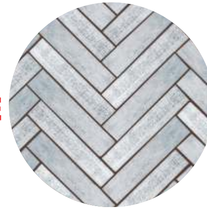
DIAGONAL SINGLE PLANK ( 3580, 3573 ) HERRINGBONE