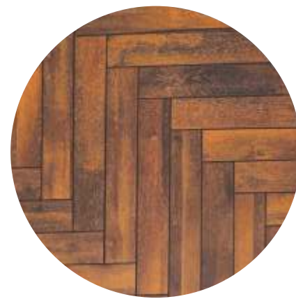
HERRINGBONE (1P) ( 3579 )