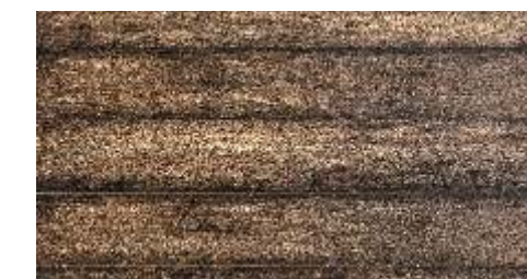
Harvest Chest (DD) Code: 3585