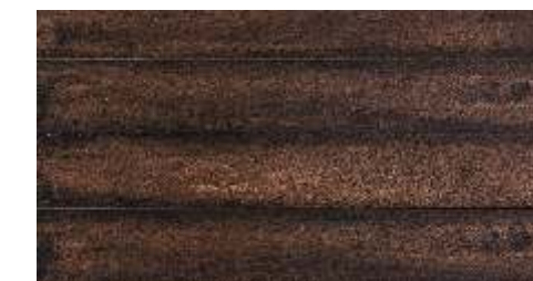
Havana Wood (DD) Code: 3583