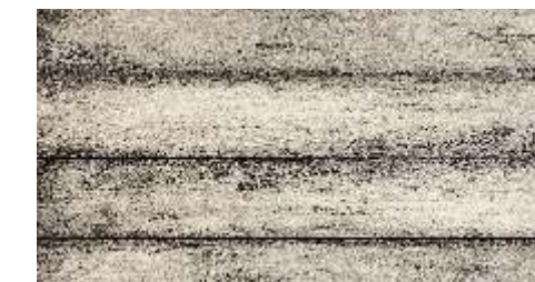
Bleached Walnut (DD) Code: 3581

French Bleed is a beautiful staining technique intended to give the look of aged wood with dark, contrasting edges. This style works well in many décors but is often blended harmoniously with rustic & country cottage styles!