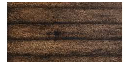
Ollie Wood (DD) Code: 3584