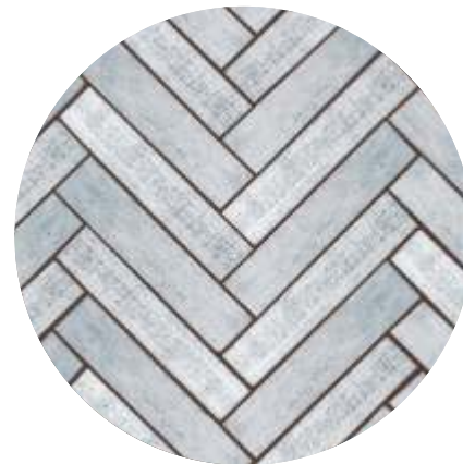
DIAGONAL SINGLE PLANK ( 3580, 3573 ) HERRINGBONE