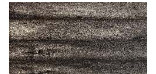
Silver Wood (DD) Code: 3582