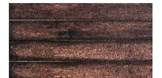
Brandy (DD) Code: 3586