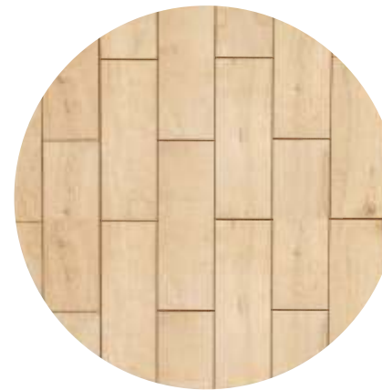
BRICK - V ( 3578 )