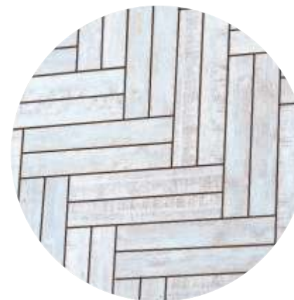
HERRINGBONE - 2P -WEAVE ( 3580, 3573 )