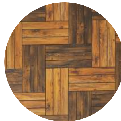
HERRINGBONE -3P WEAVE ( 3090, 3092 )